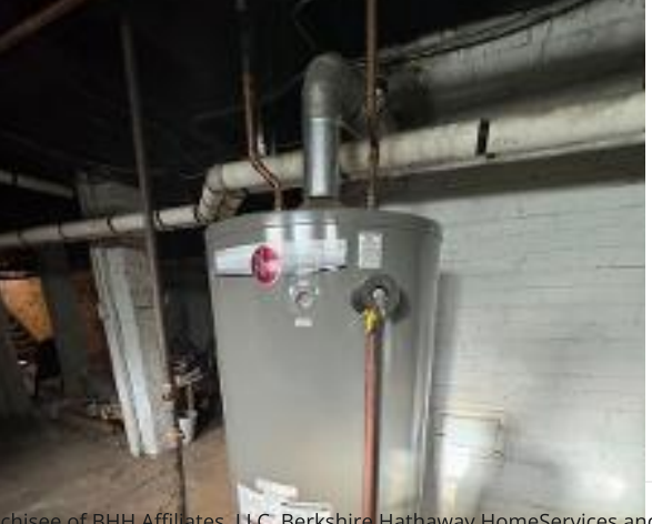
© 2024 BHH Affiliates, LLC. An independently operated subsidiary of H the Berkshire Hathaway HomeServices symbol are