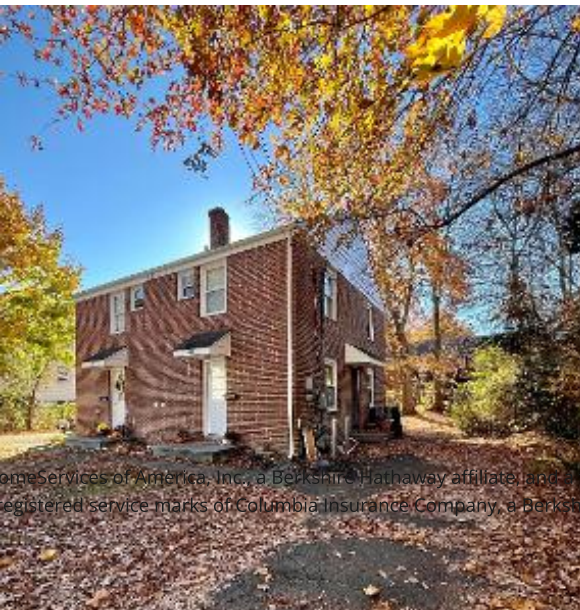
ranchisee of BHH Affiliates, LLC. Berkshire Hathaway HomeServices and re Hathaway affiliate. Equal Housing Opportunity. 🏫