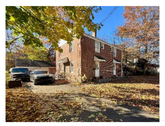
© 2024 BHH Affiliates, LLC. An independently operated subsidiary of H the Berkshire Hathaway HomeServices symbol are r