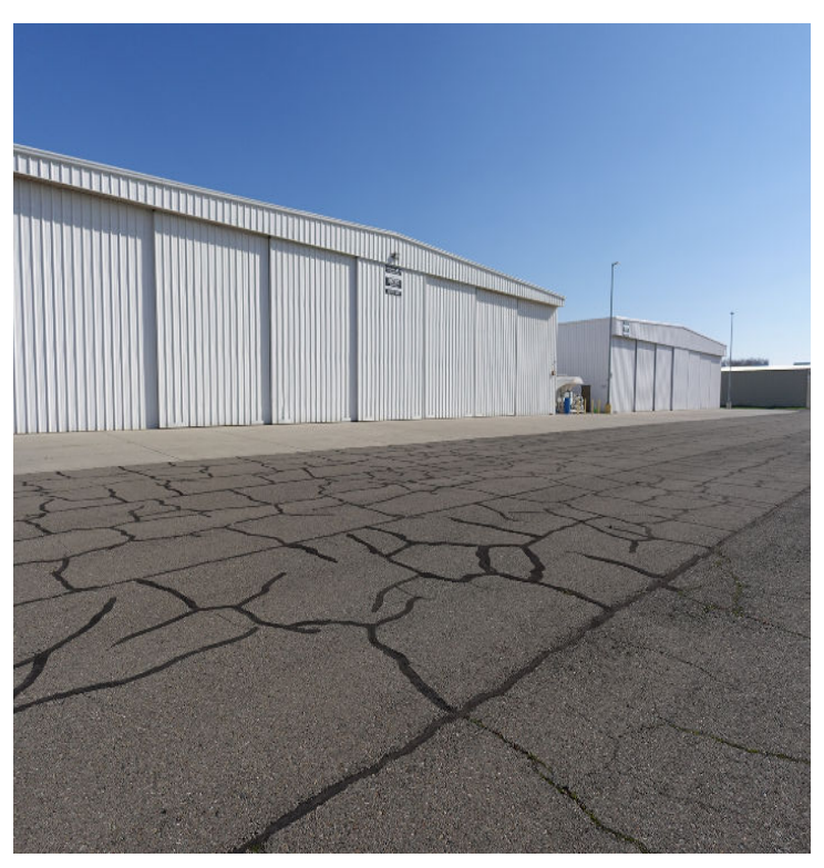
HANGER PROPERTY FOR SALE