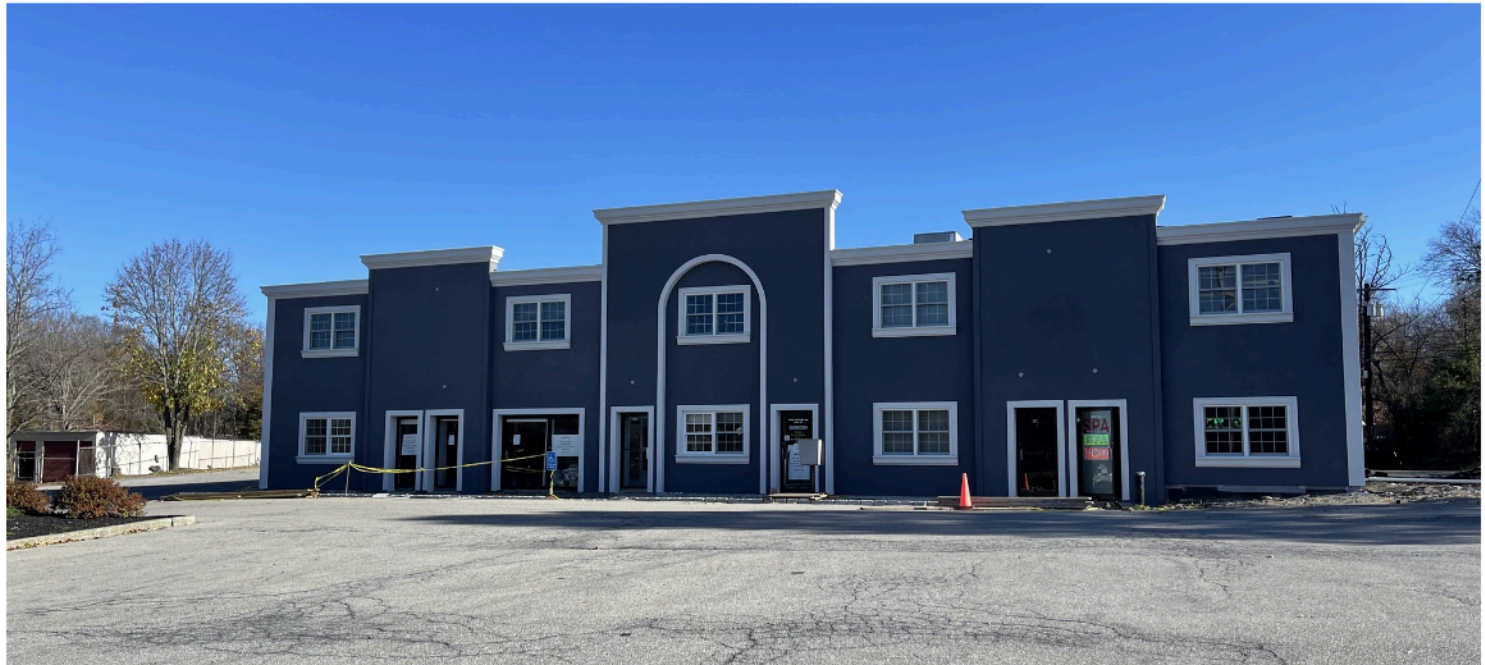
Office / Retail Building

FULL SITE PLAN & SURVEY AVAILABLE UPON REQUEST