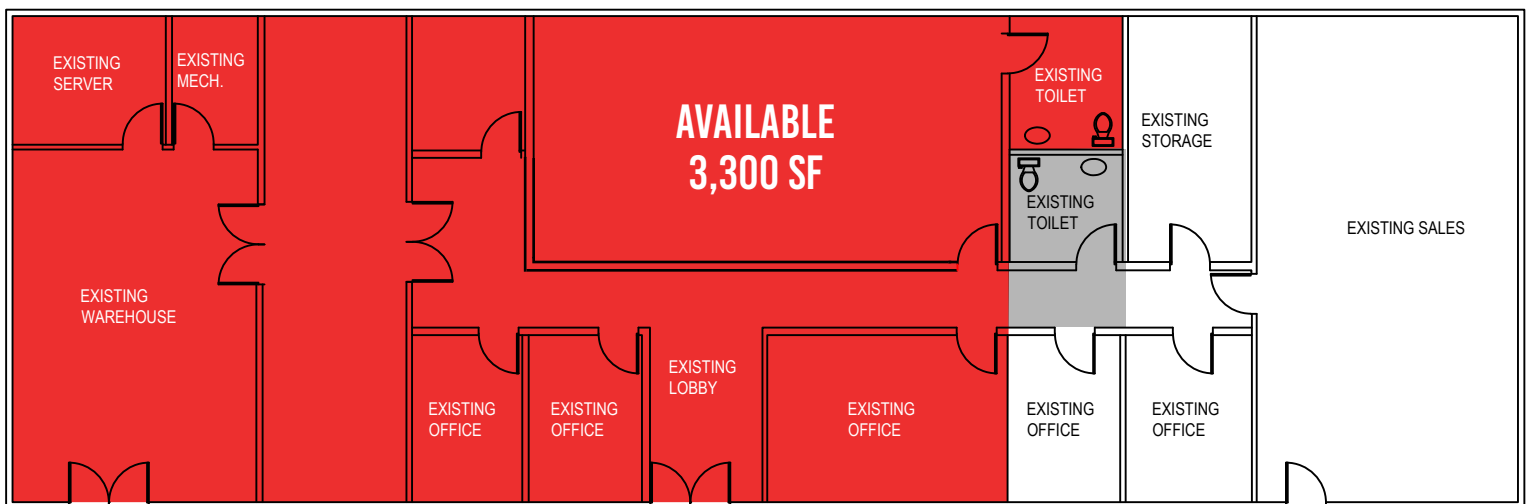
POTENTIAL COMMON AREA