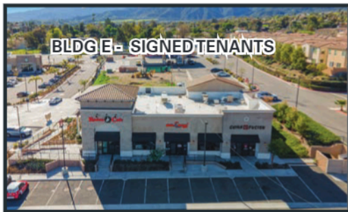
BLDG E - SIGNED TENANTS