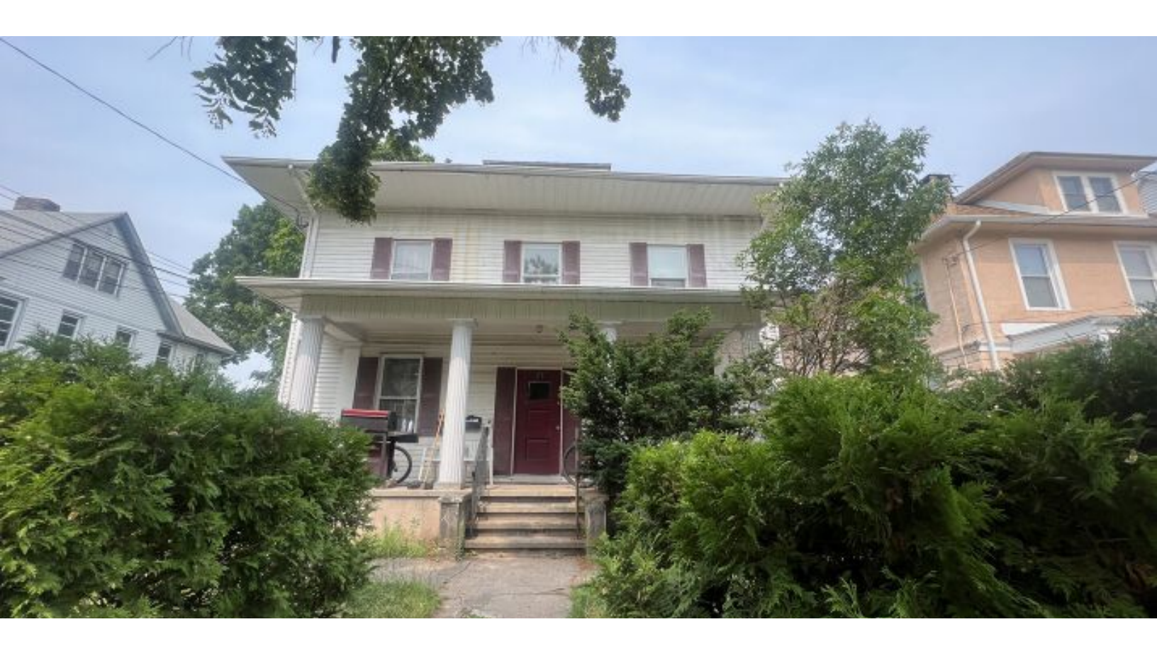
21 Young St, New Haven, CT 06511