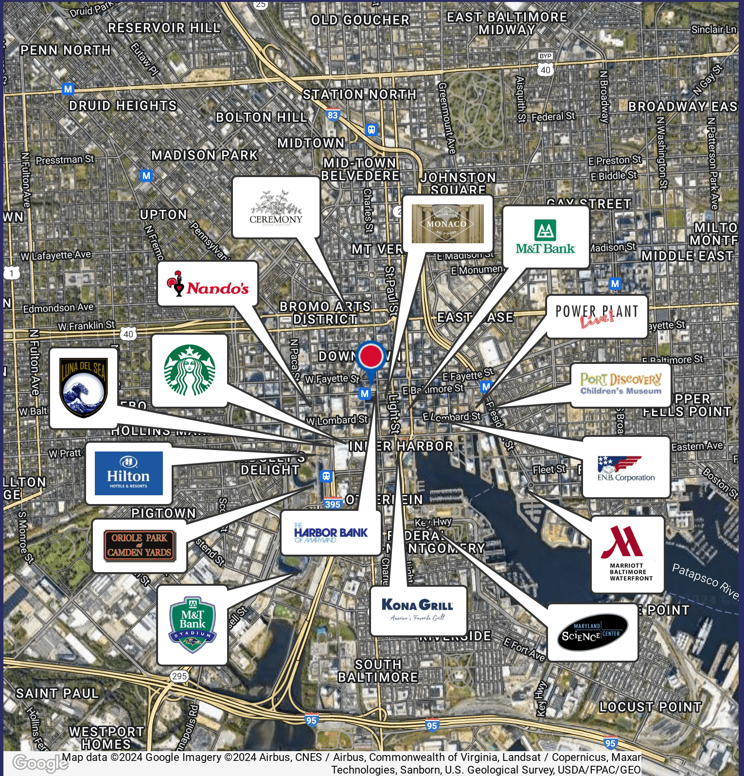
Map data ©2024 Google Imagery ©2024 Airbus, CNES / Airbus, Commonwealth of Virginia, Landsat / Copernicus, Maxar Technologies, Sanborn, U.S. Geological Survey, USDA/FPAC/Geo