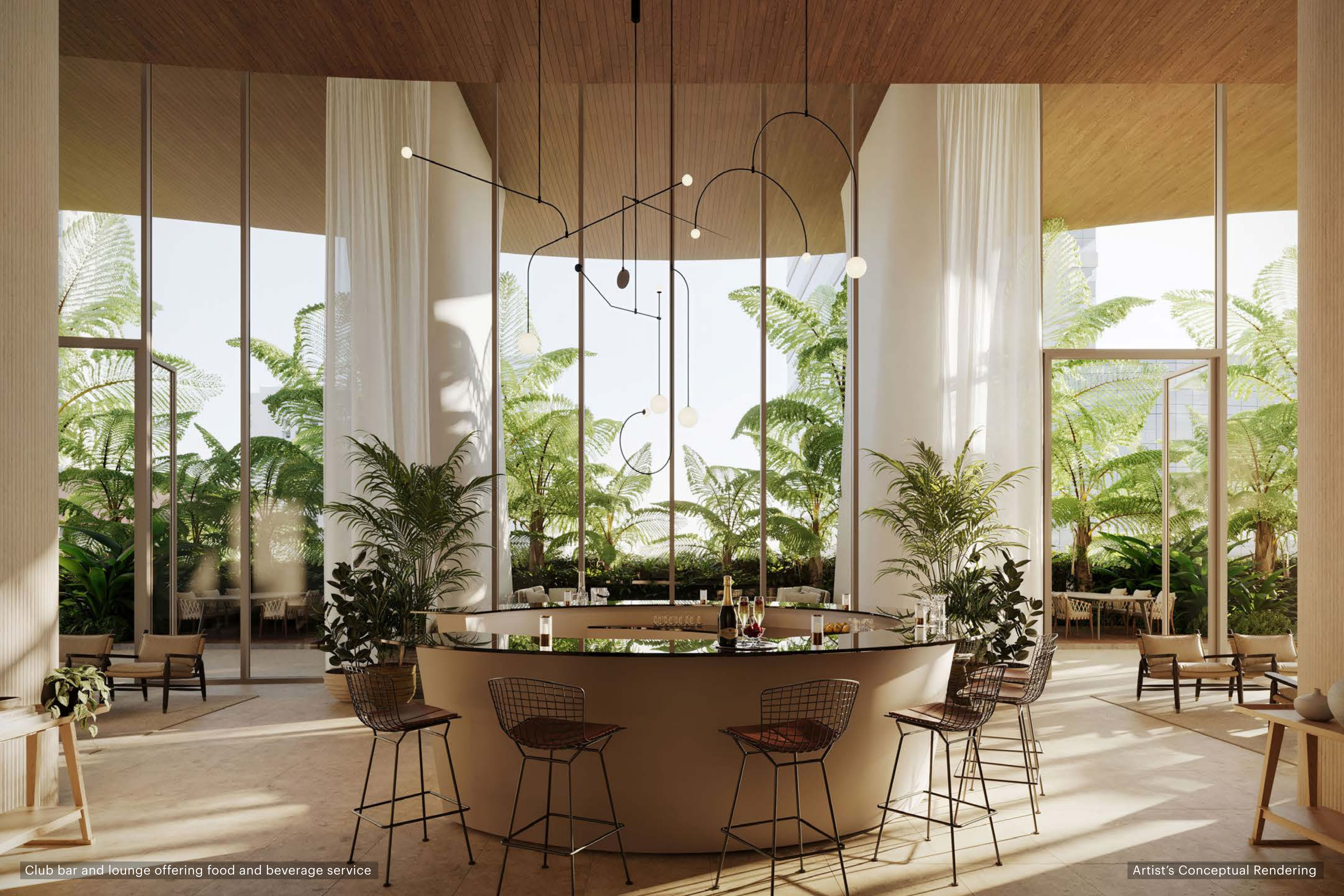
Club bar and lounge offering food and beverage service