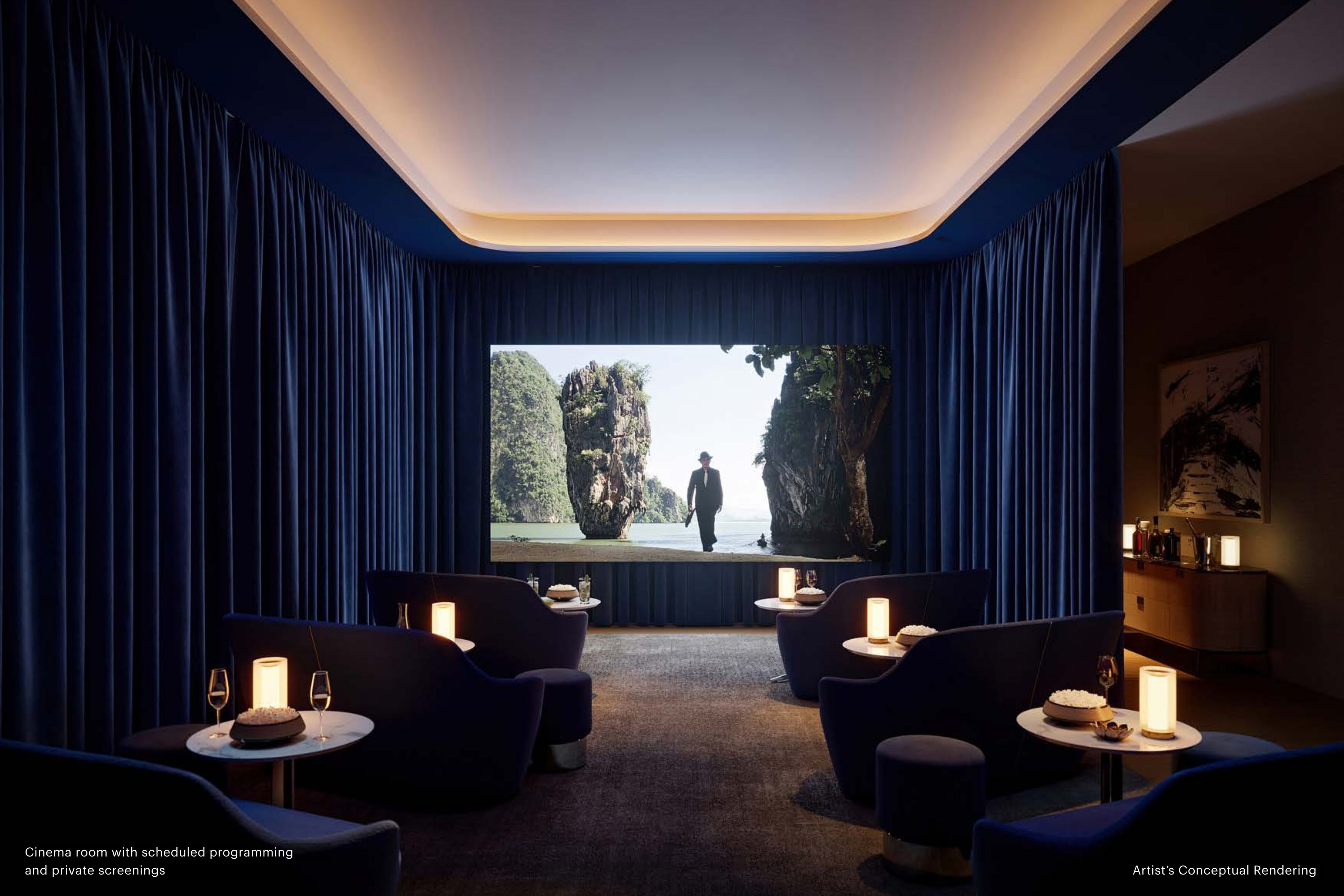
Cinema room with scheduled programming and private screenings