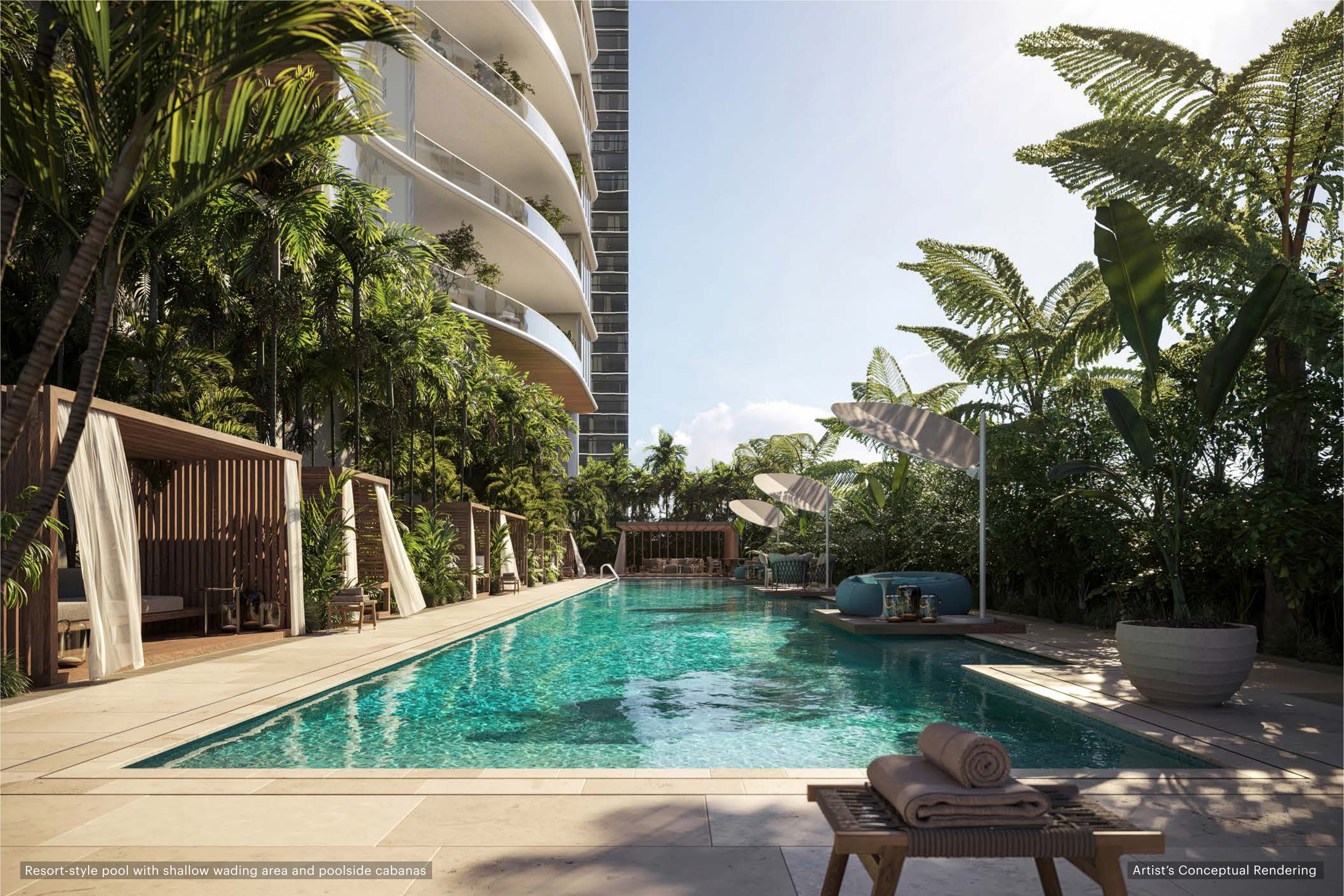
Resort-style pool with shallow wading area and poolside cabanas