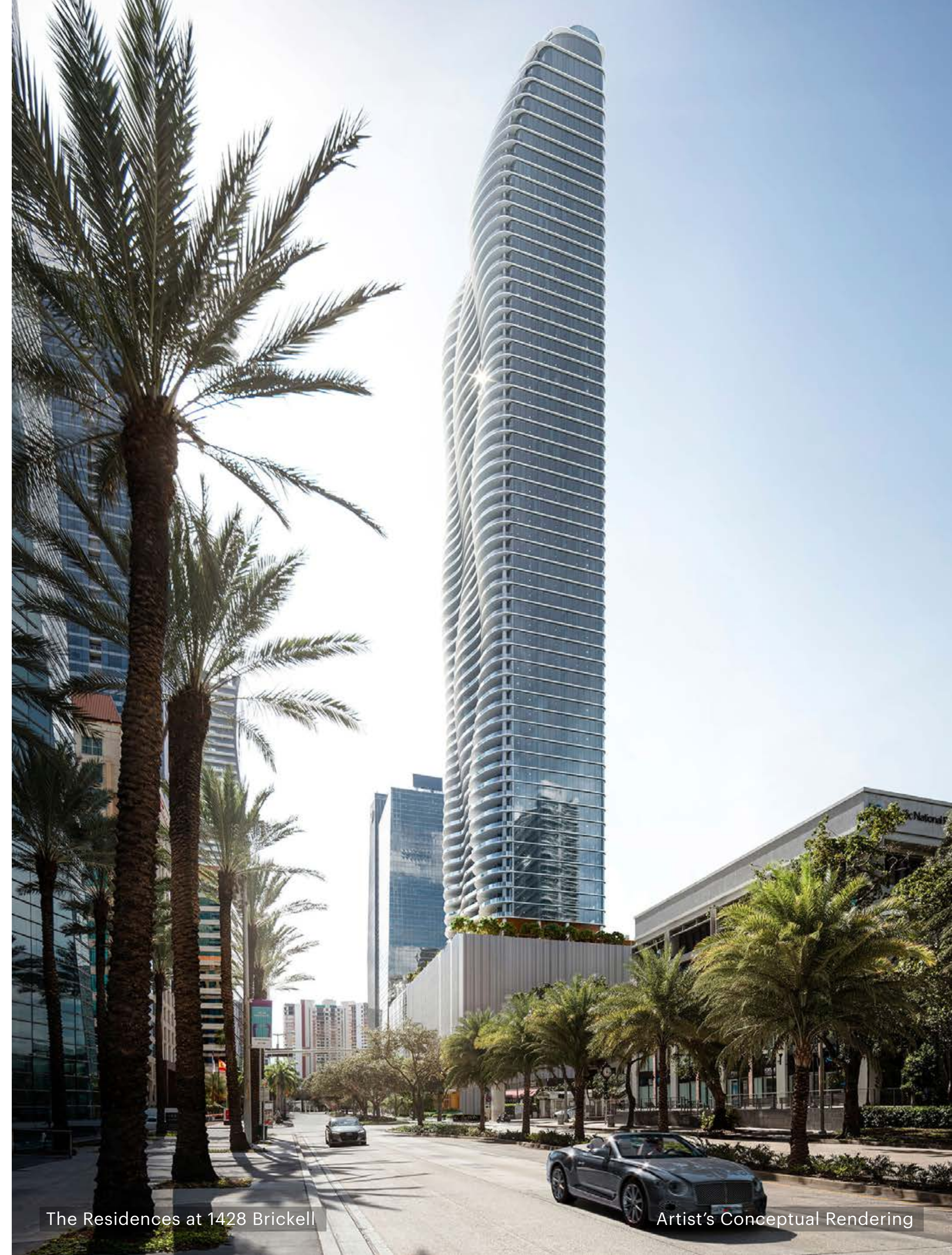
The Residences at 1428 Brickell