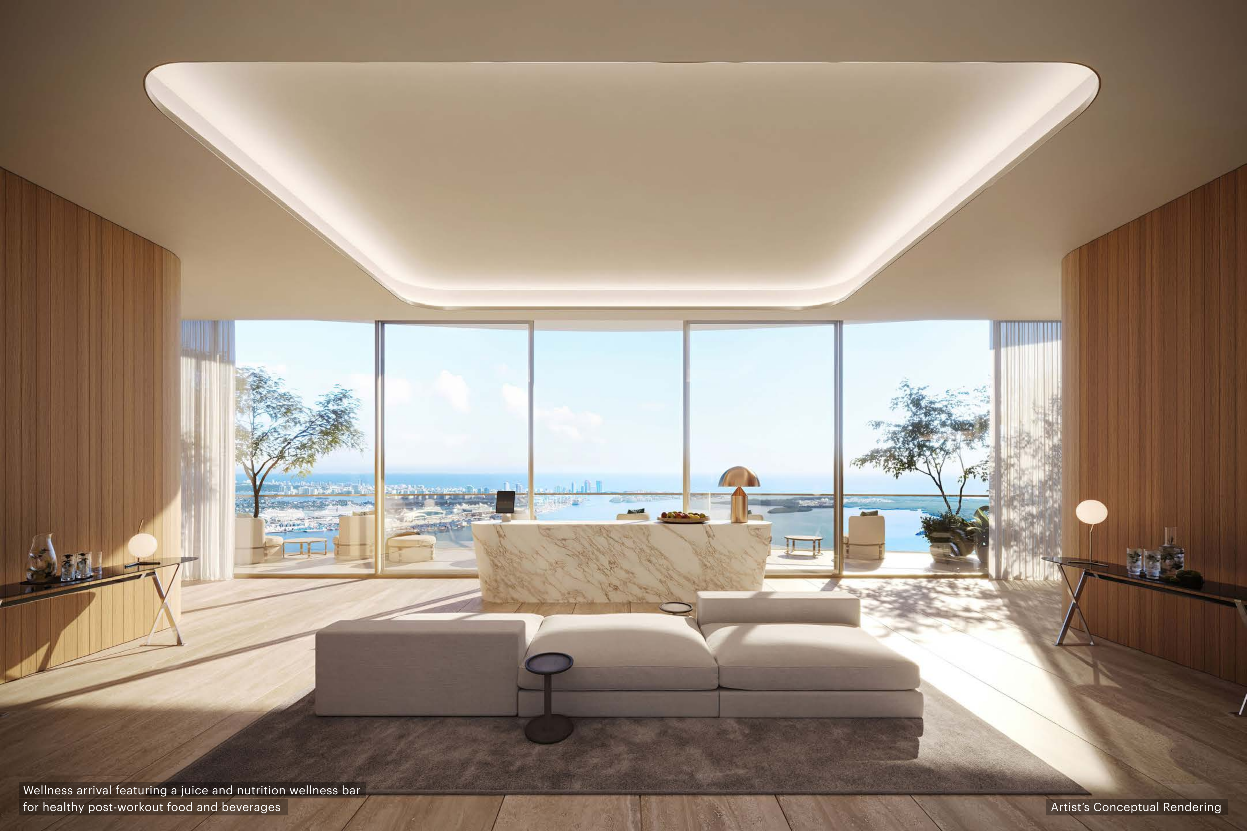
Wellness arrival featuring a juice and nutrition wellness bar for healthy post-workout food and beverages