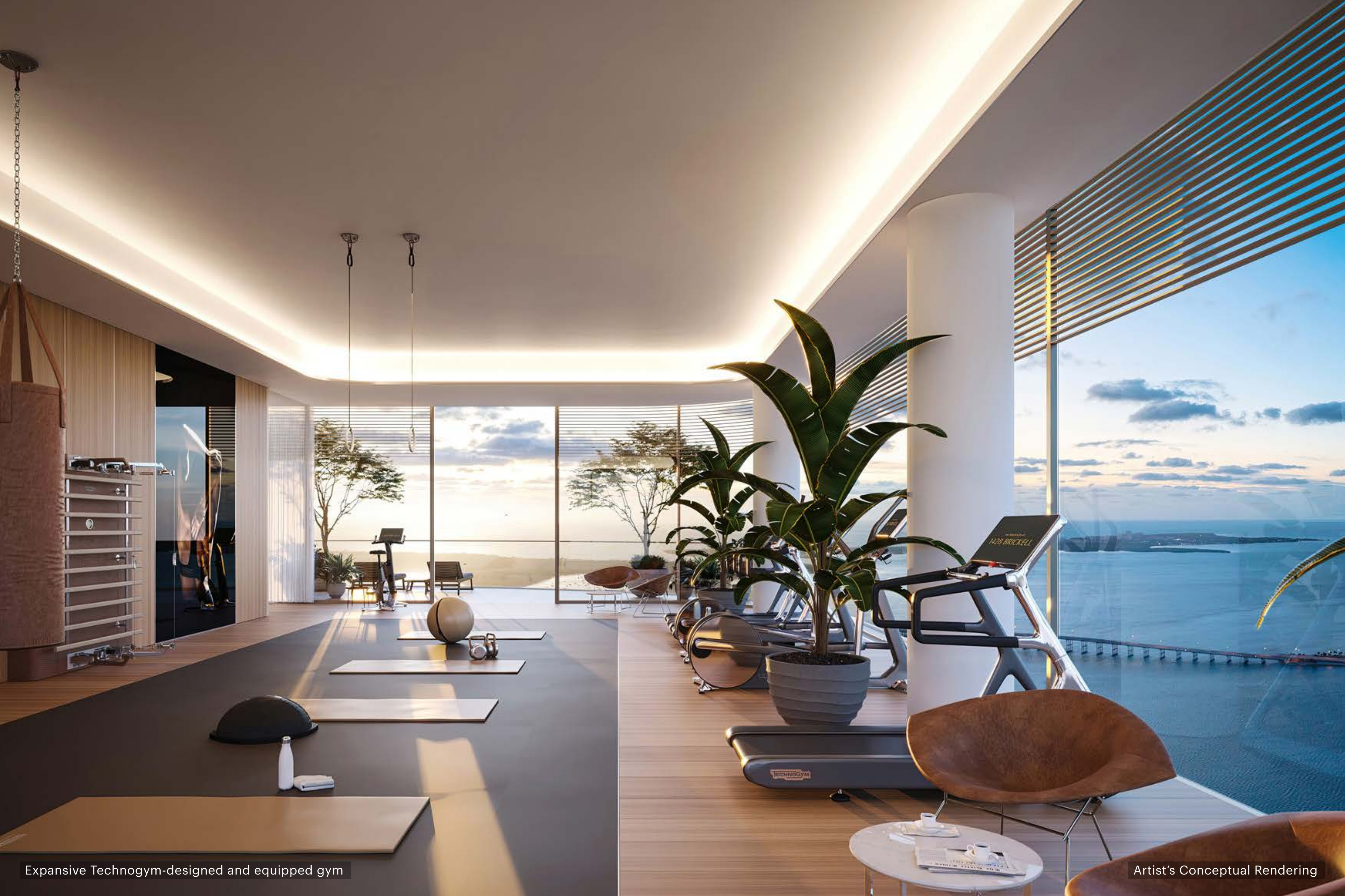
Expansive Technogym-designed and equipped gym