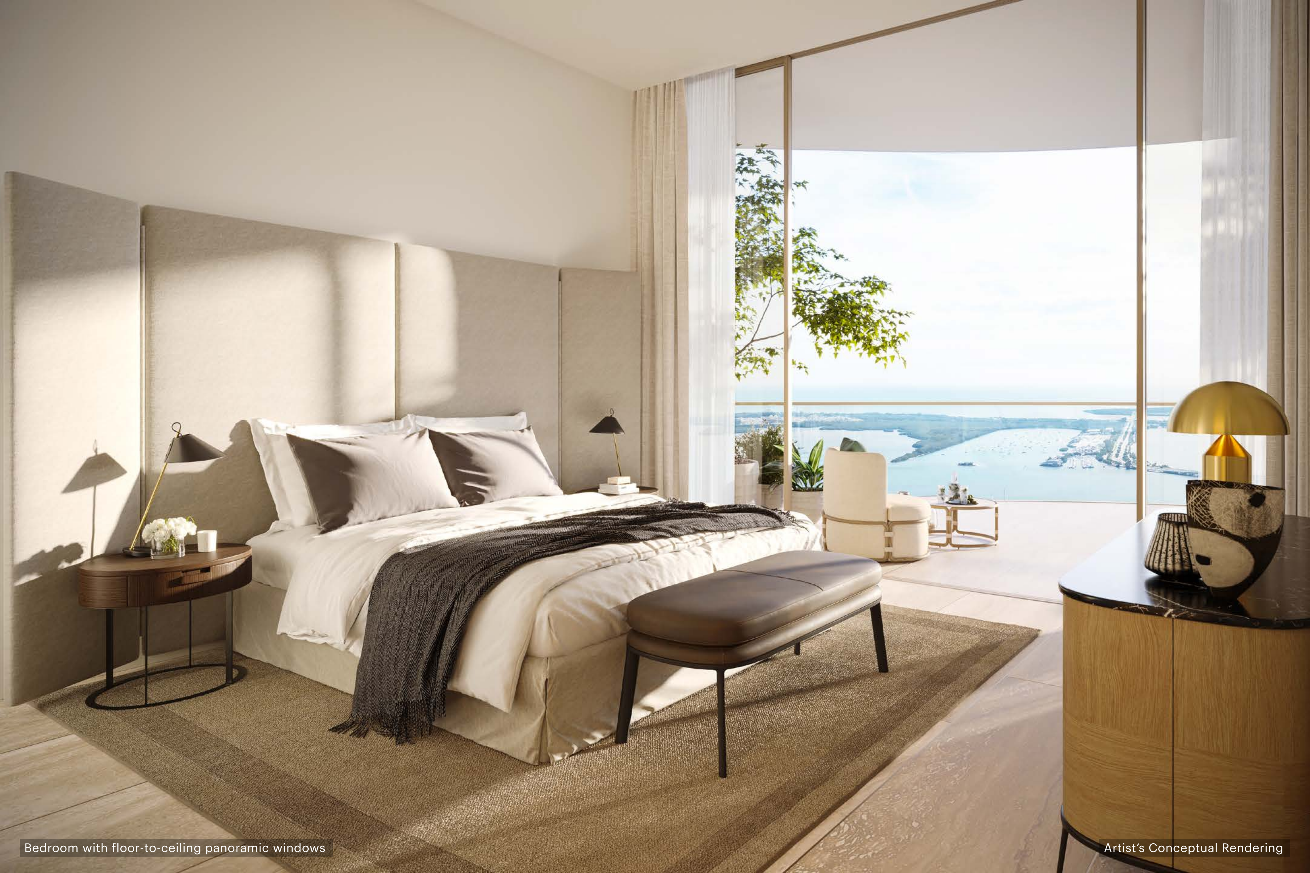
Bedroom with floor-to-ceiling panoramic windows