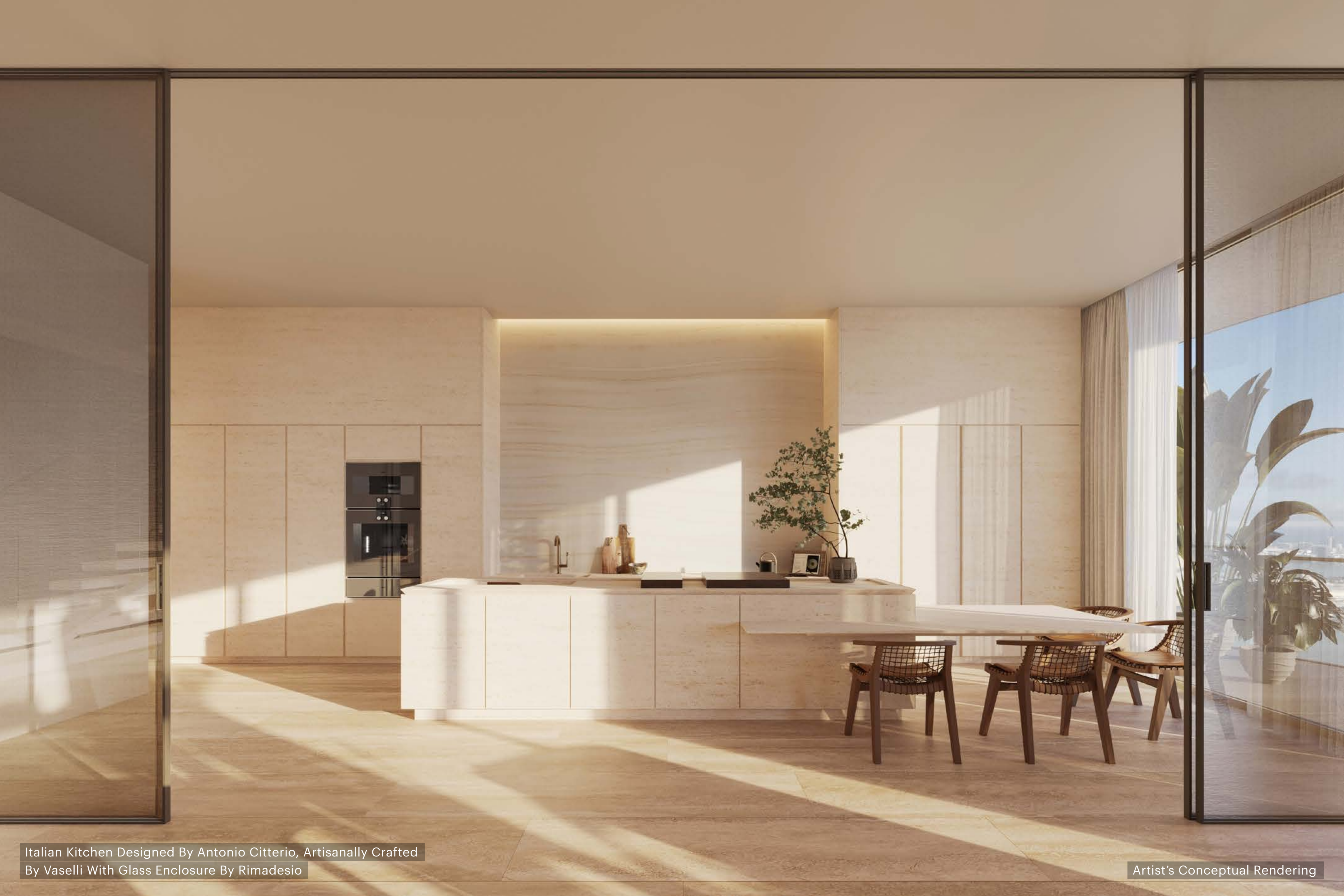
Italian Kitchen Designed By Antonio Citterio, Artisanally Crafted By Vaselli With Glass Enclosure By Rimadesio