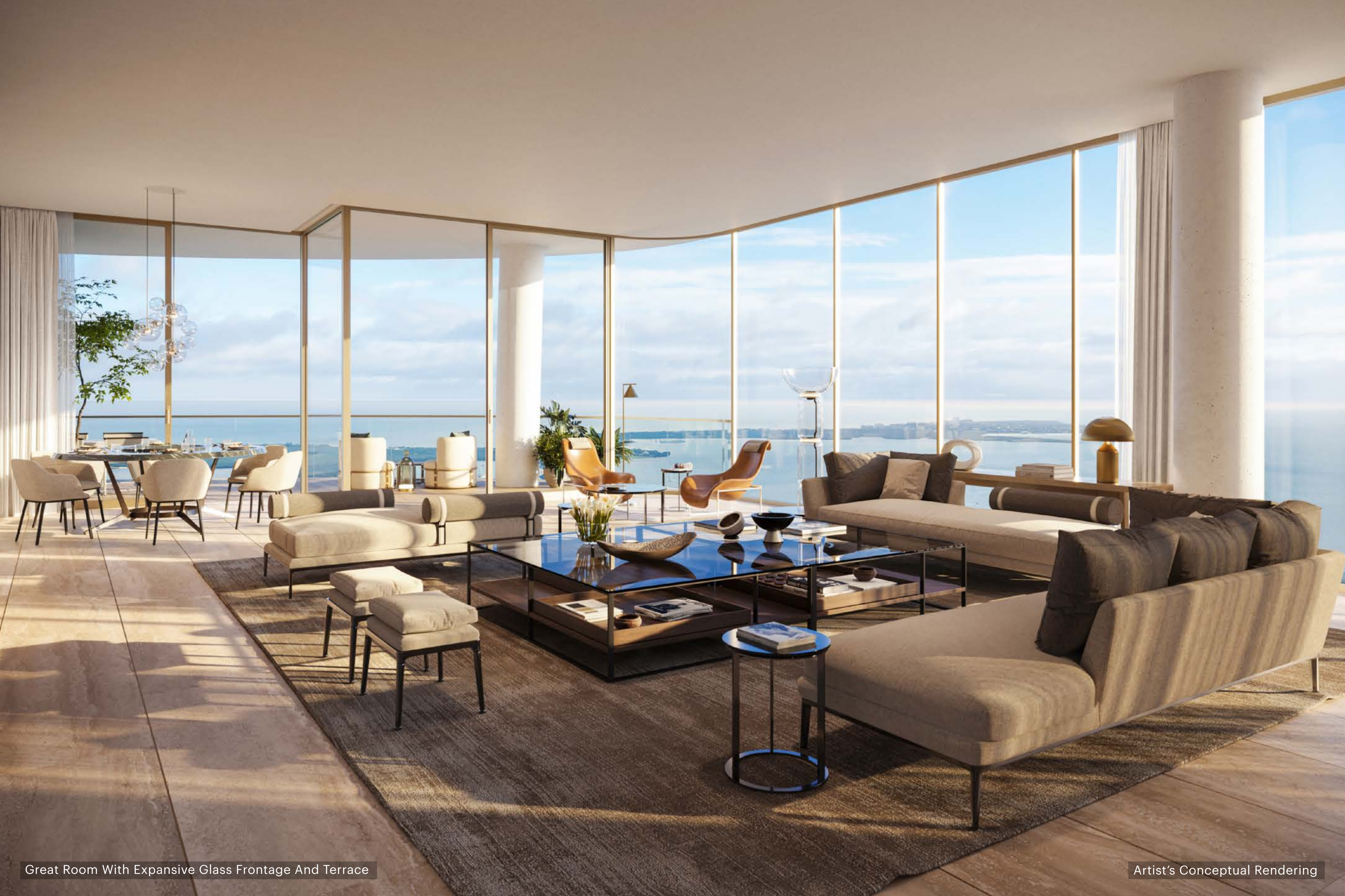
Great Room With Expansive Glass Frontage And Terrace