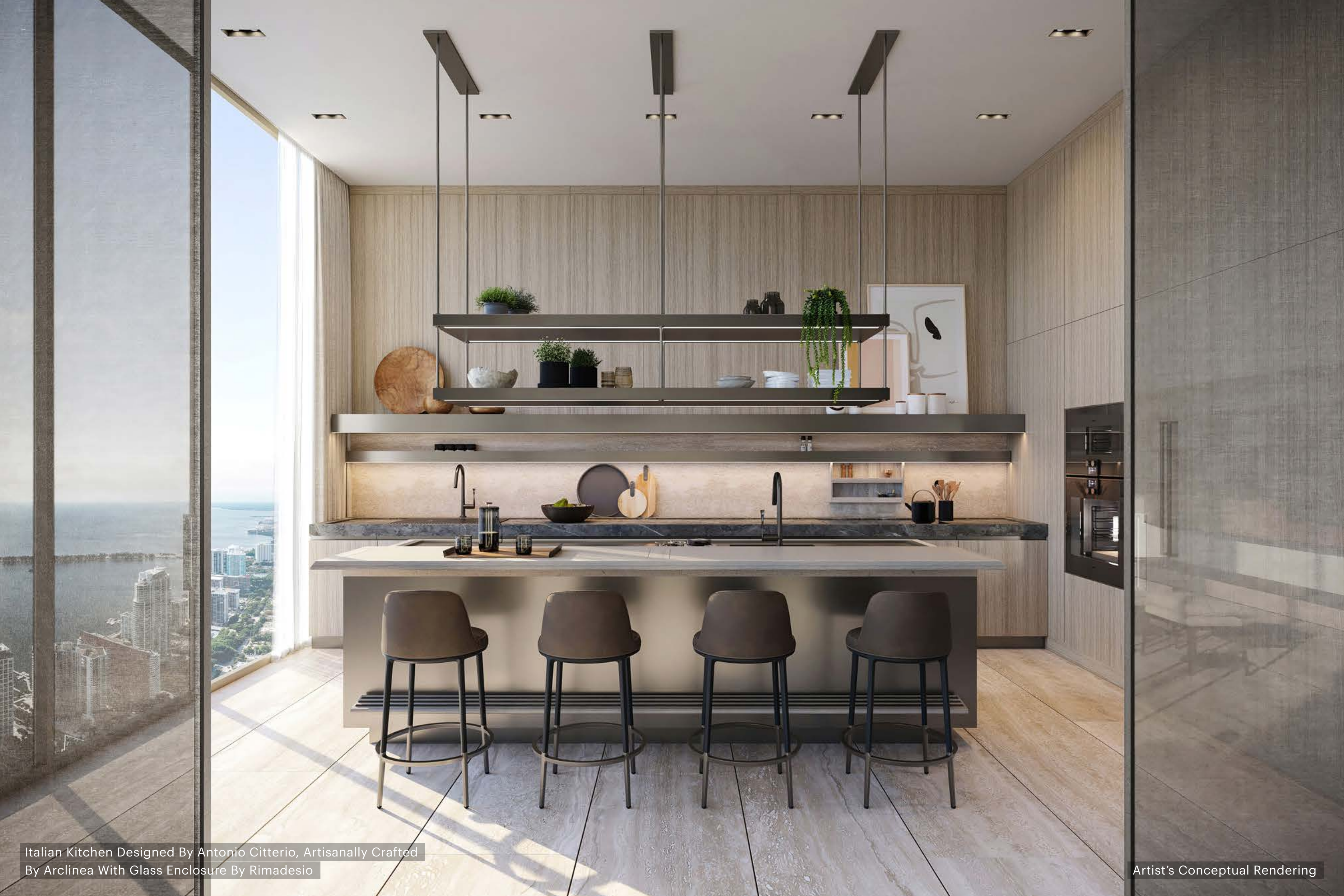
Italian Kitchen Designed By Antonio Citterio, Artisanally Crafted By Arclinea With Glass Enclosure By Rimadesio