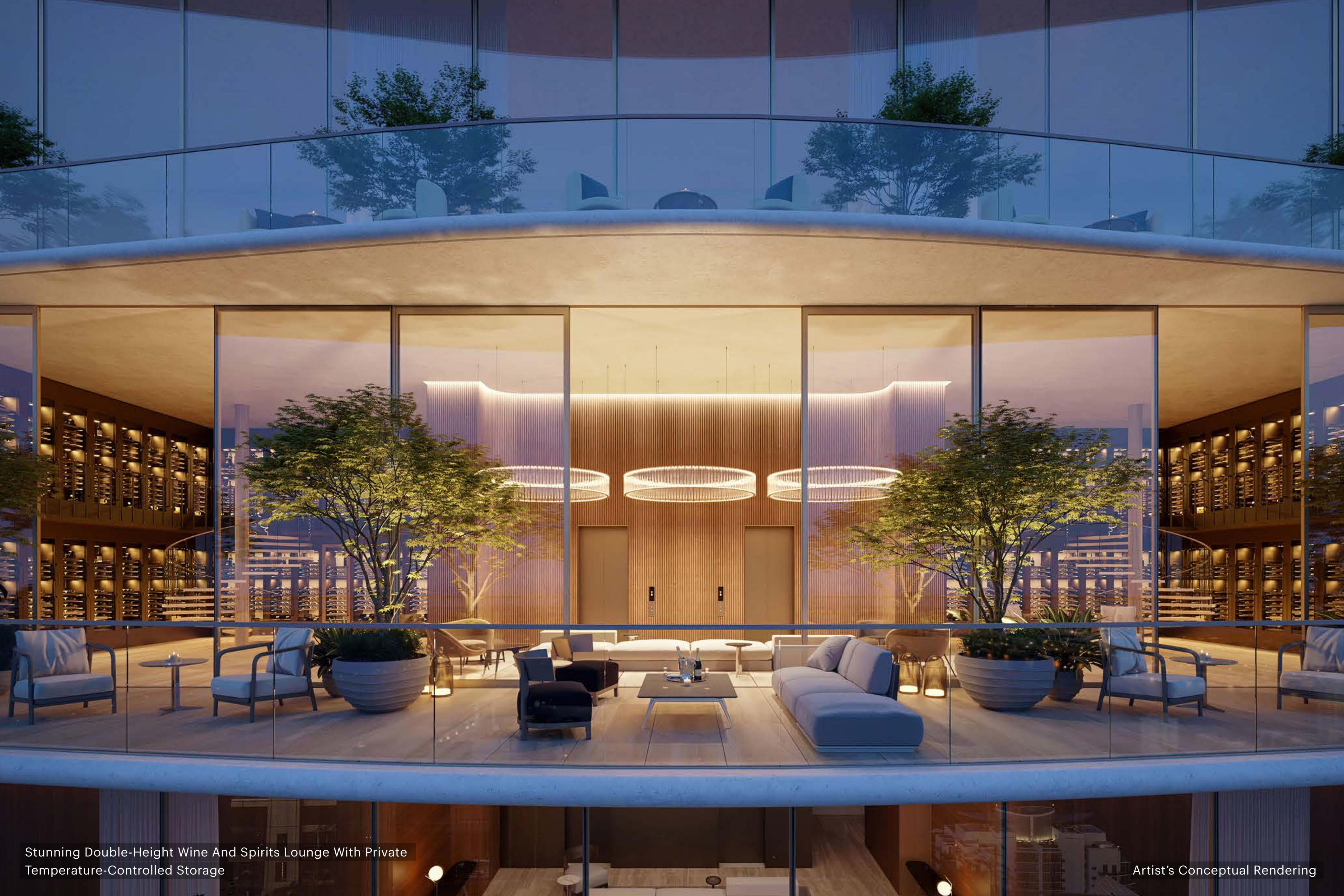
Stunning Double-Height Wine And Spirits Lounge With Private Temperature-Controlled Storage