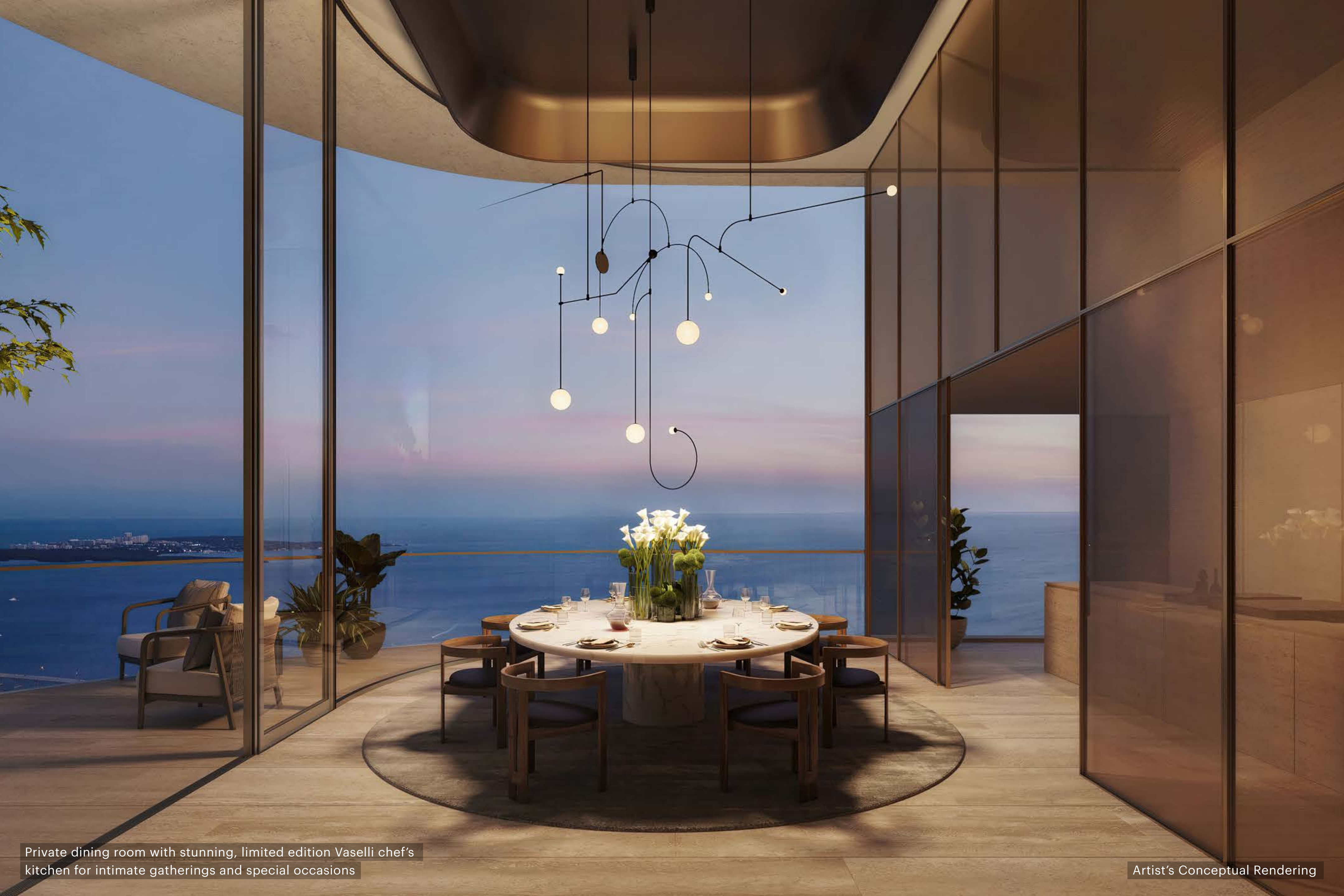
Private dining room with stunning, limited edition Vaselli chef's kitchen for intimate gatherings and special occasions