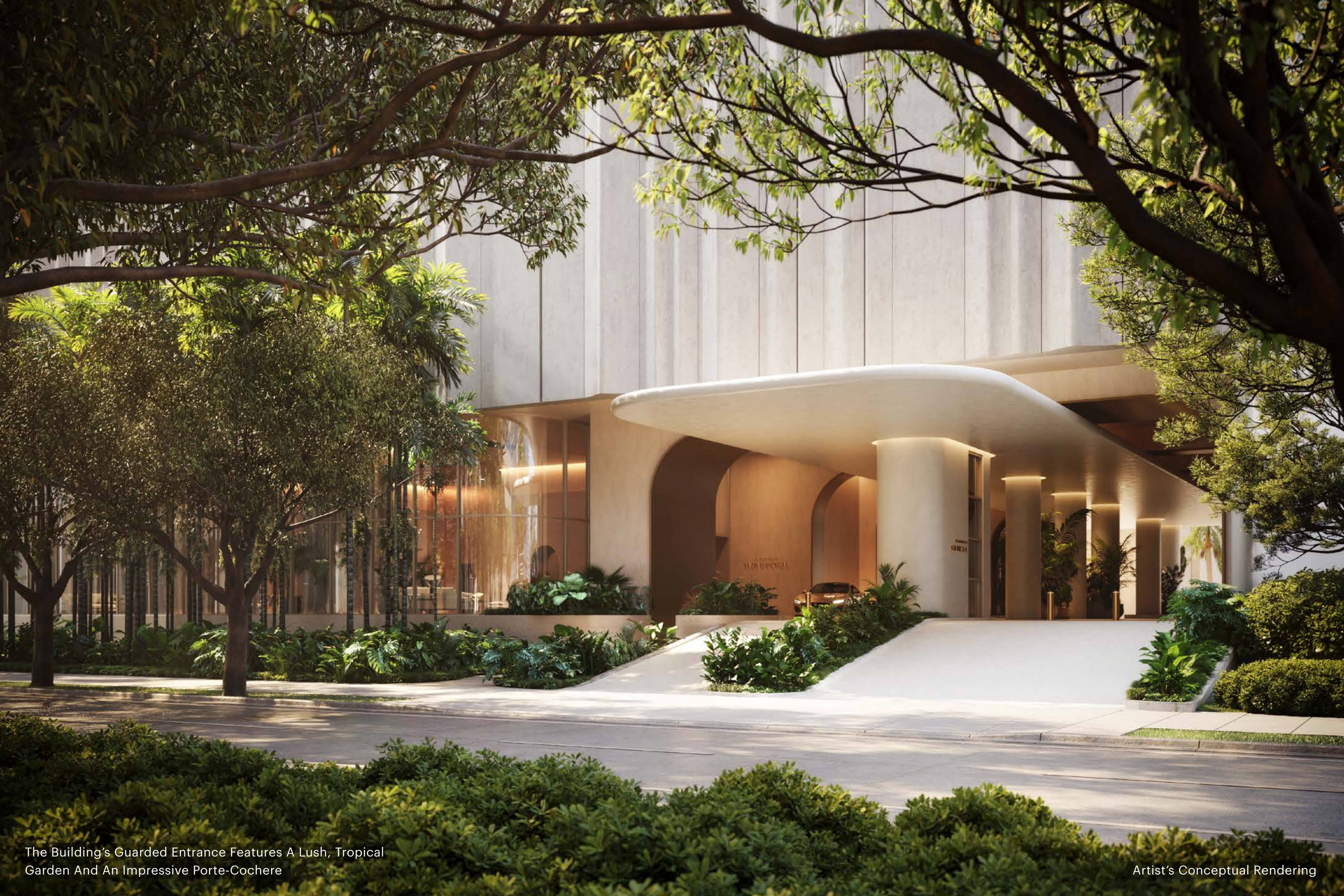
The Building's Guarded Entrance Features A Lush, Tropical Garden And An Impressive Porte-Cochere