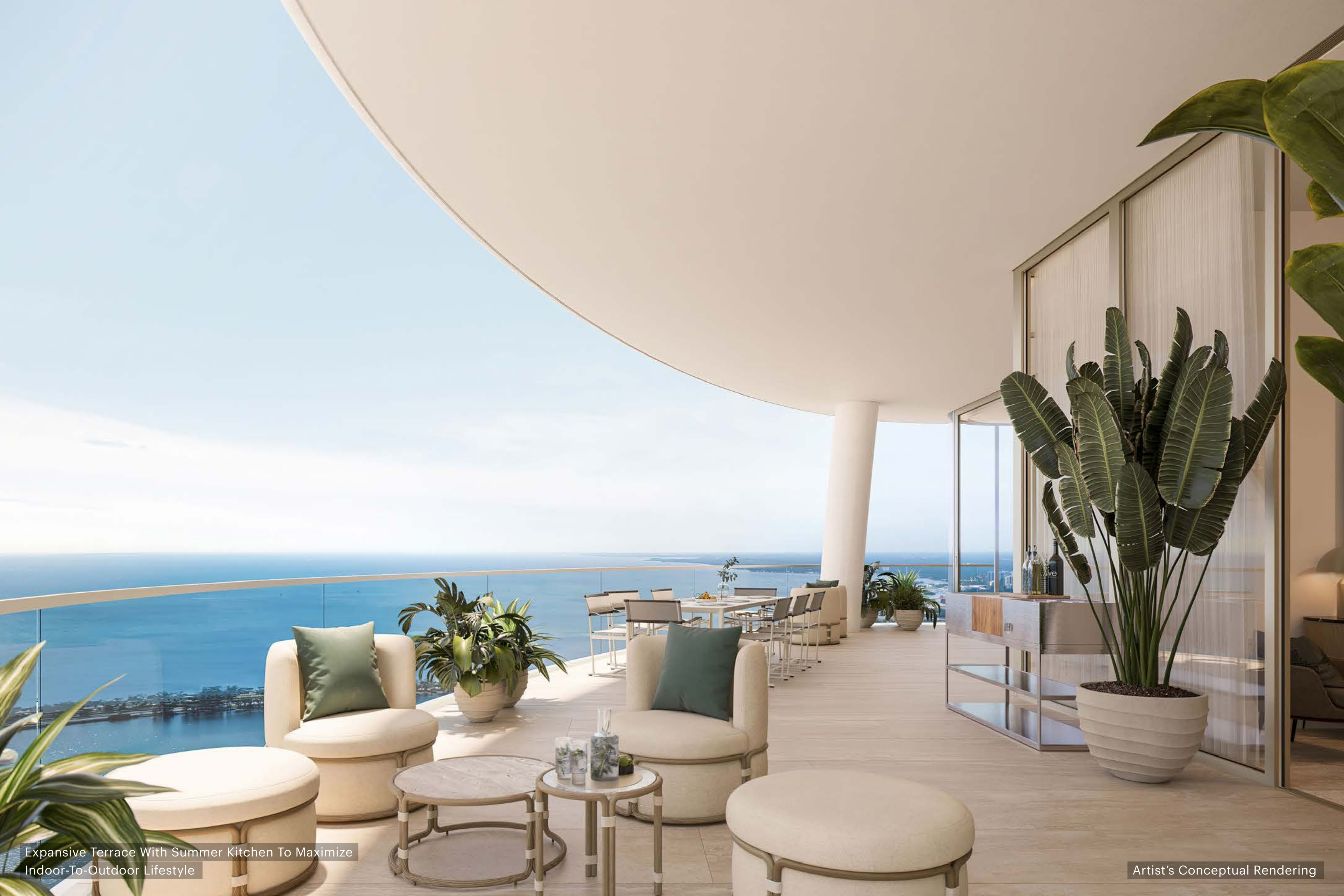
Expansive Terrace With Summer Kitchen To Maximize Indoor-To-Outdoor Lifestyle