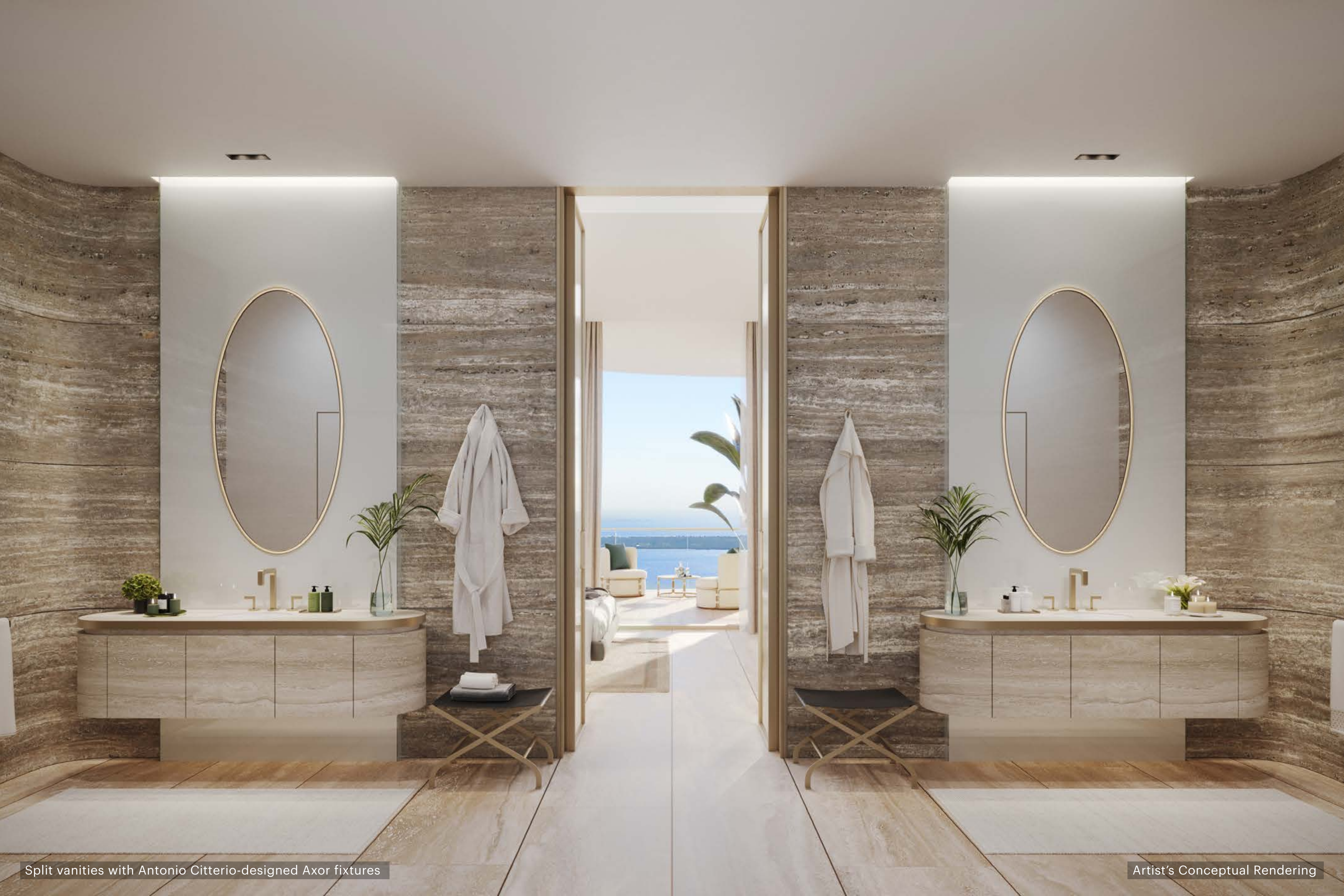
Split vanities with Antonio Citterio-designed Axor fixtures