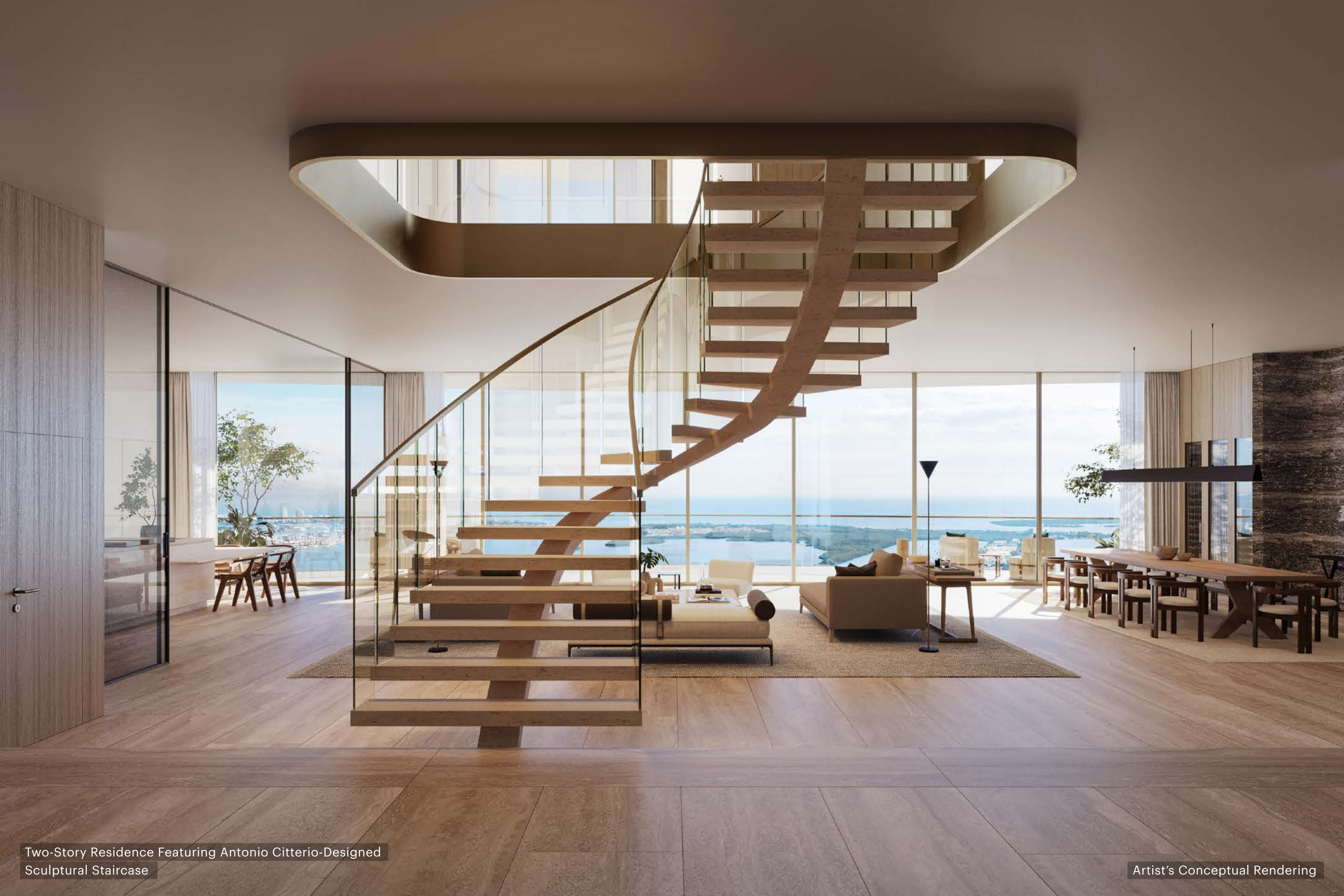
Two-Story Residence Featuring Antonio Citterio-Designed Sculptural Staircase