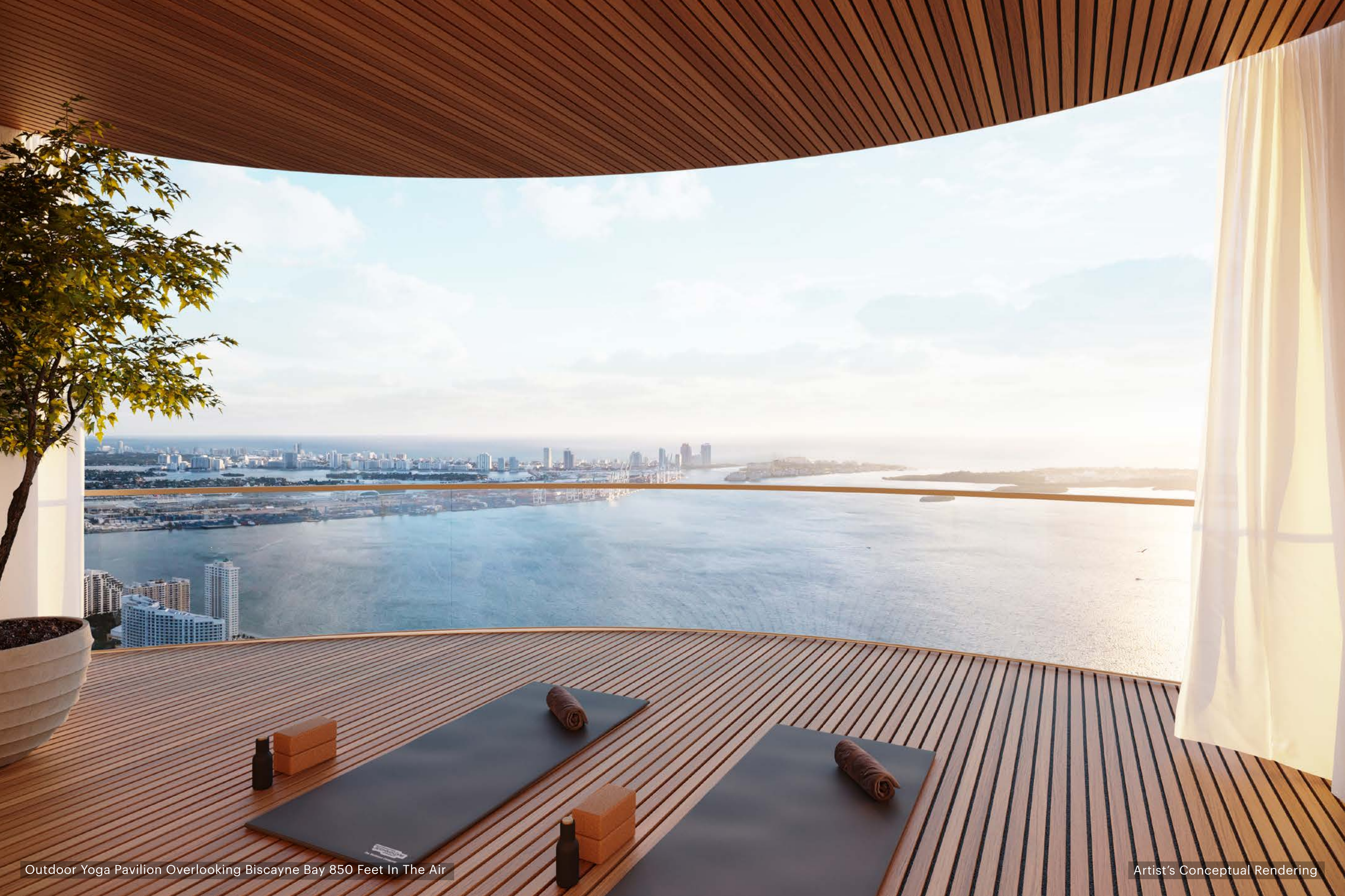
Outdoor Yoga Pavilion Overlooking Biscayne Bay 850 Feet In The Air