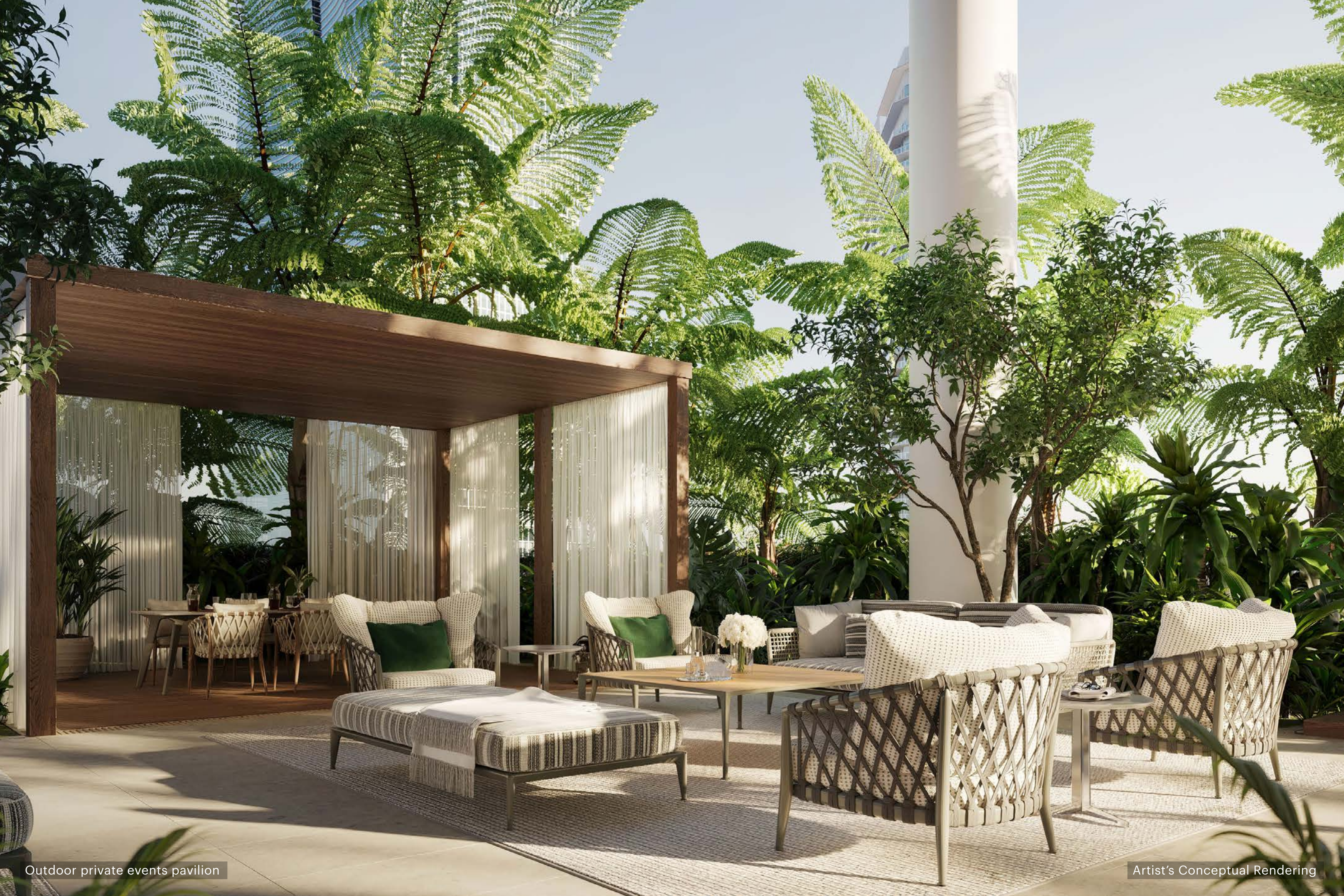
Outdoor private events pavilion