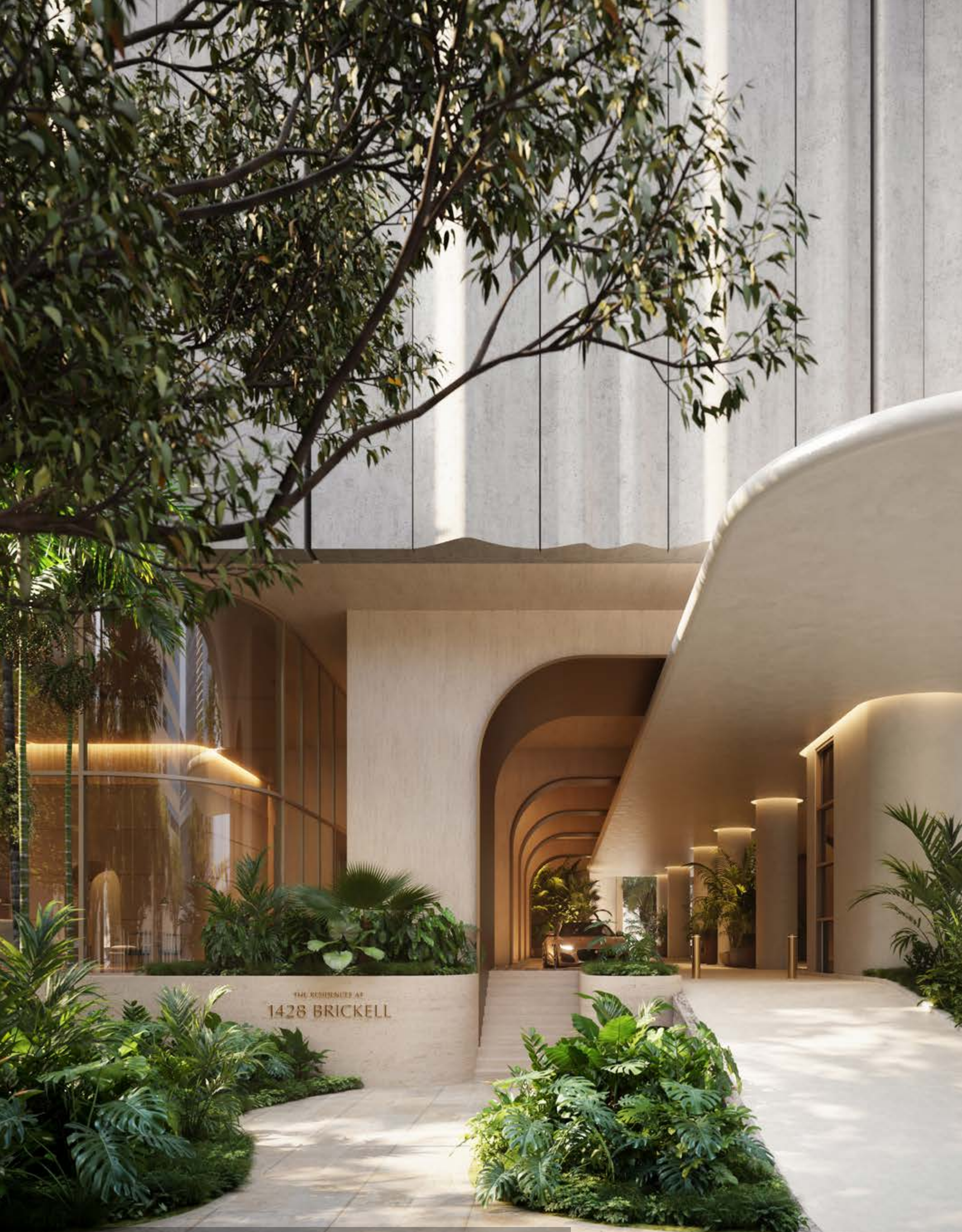
The Building's Guarded Entrance Features A Lush, Tropical Garden And An Impressive Porte-Cochere