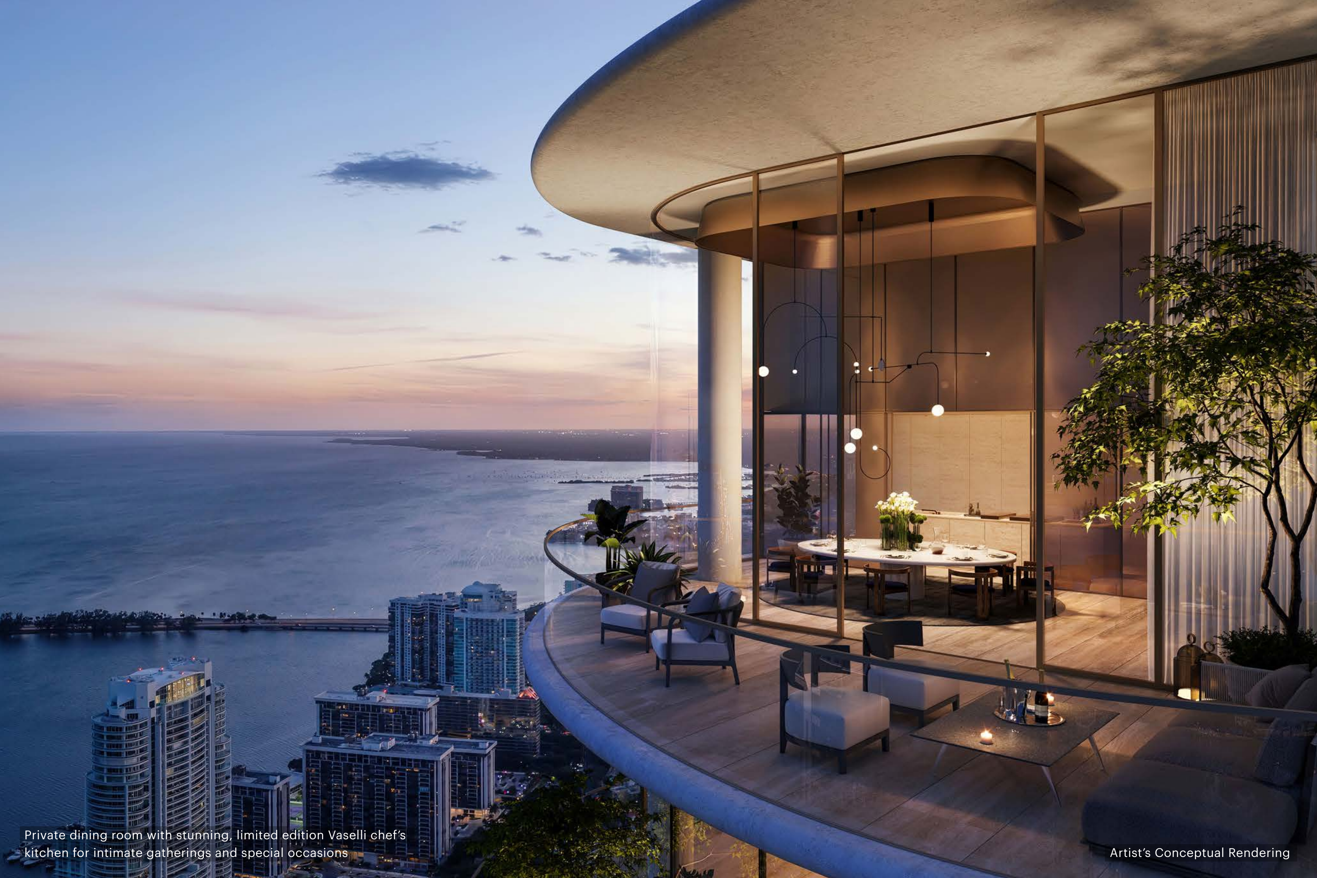
Private dining room with stunning, limited edition Vaselli chef's kitchen for intimate gatherings and special occasions