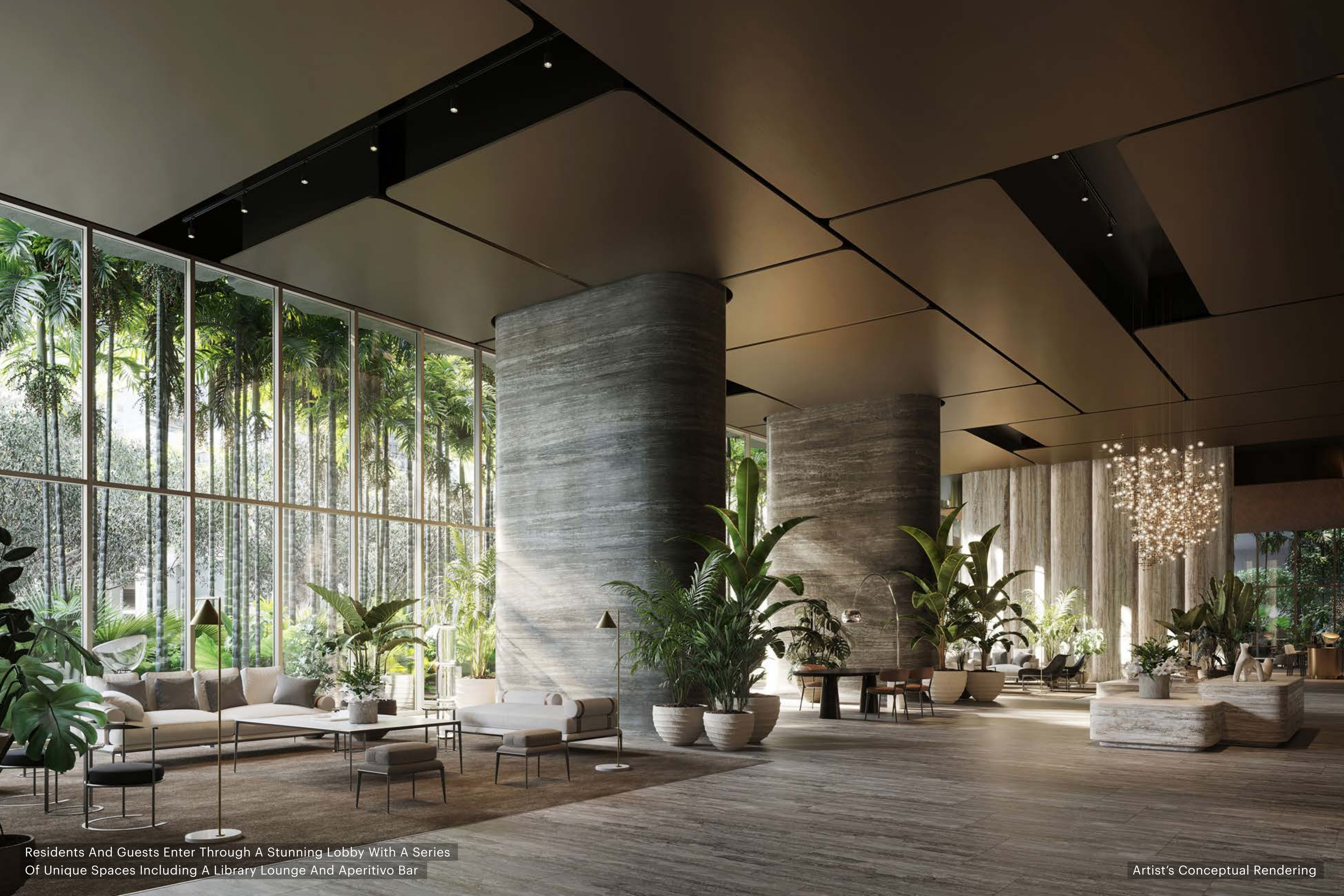
Residents And Guests Enter Through A Stunning Lobby With A Series Of Unique Spaces Including A Library Lounge And Aperitivo Bar