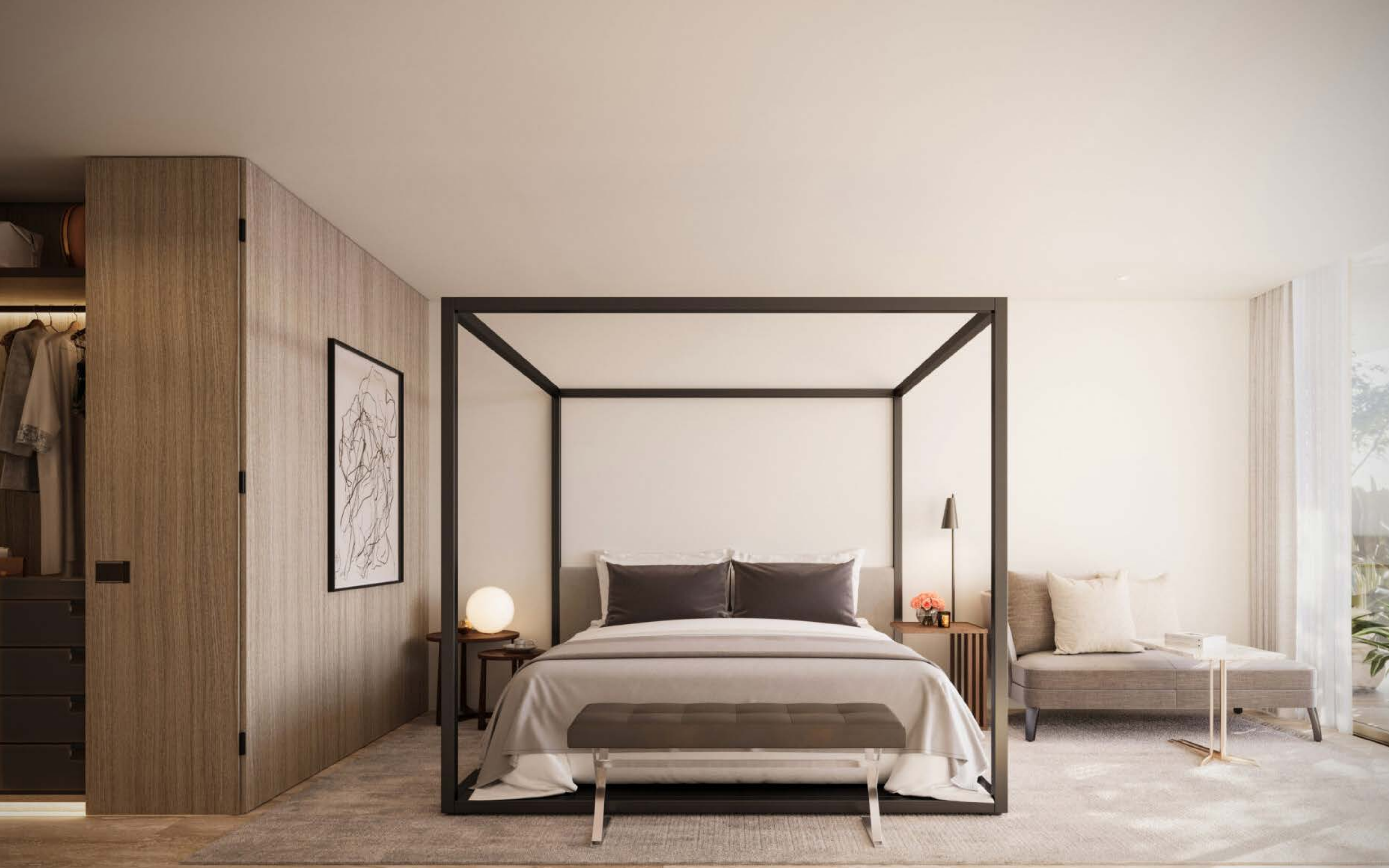
Fully furnished, Antonio Citterio-designed private suites exclusively for residents' guests and their families