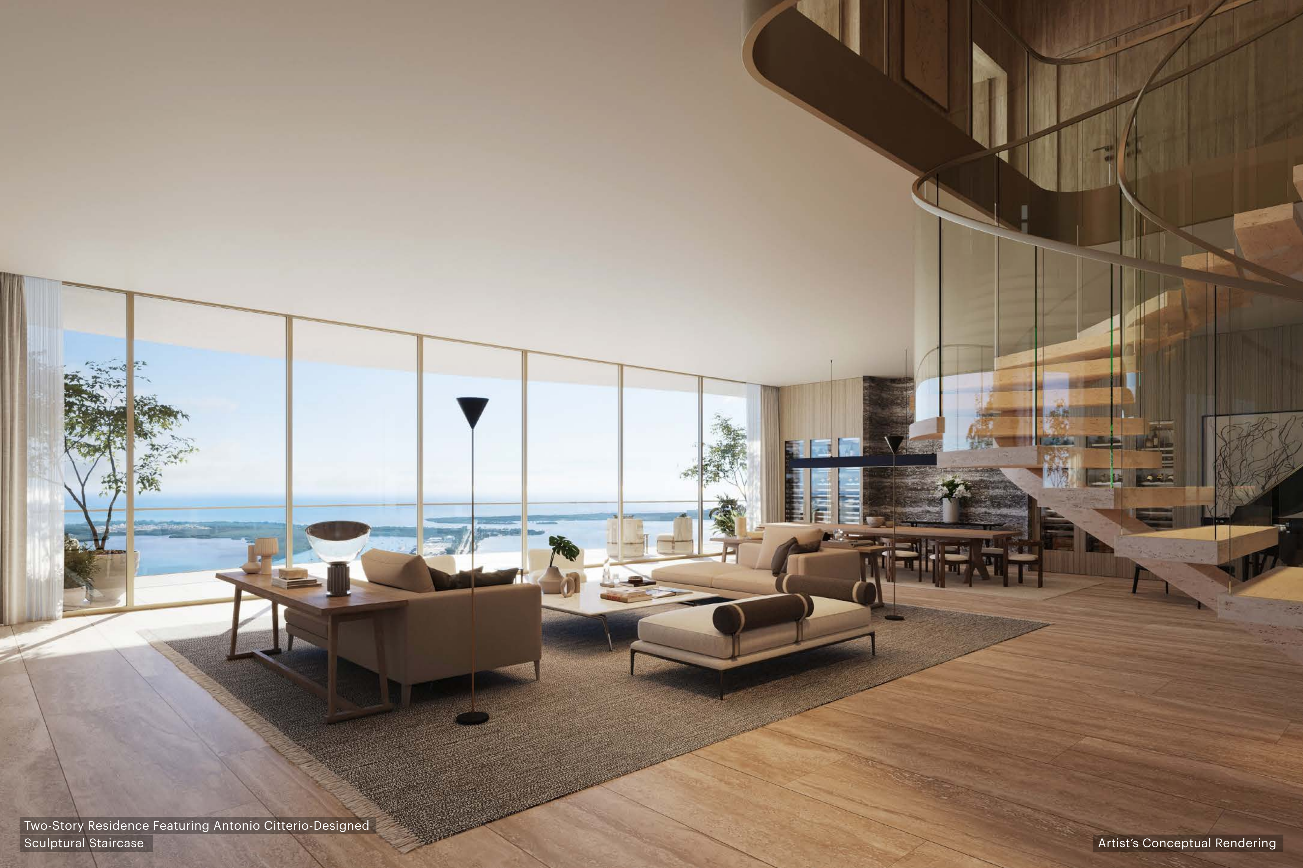
Two-Story Residence Featuring Antonio Citterio-Designed Sculptural Staircase