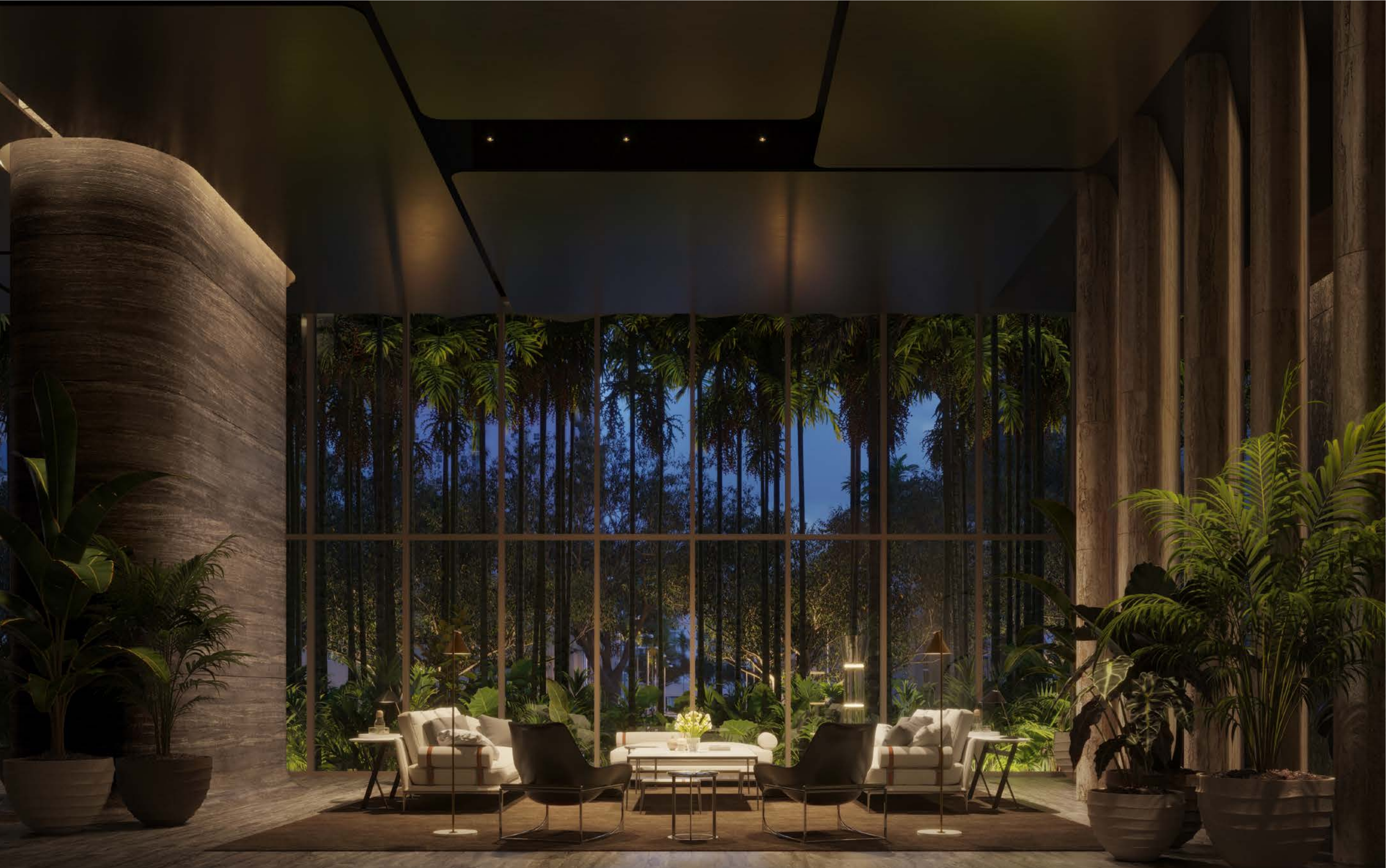
Residents And Guests Enter Through A Stunning Lobby With A Series Of Unique Spaces Including A Library Lounge And Aperitivo Bar