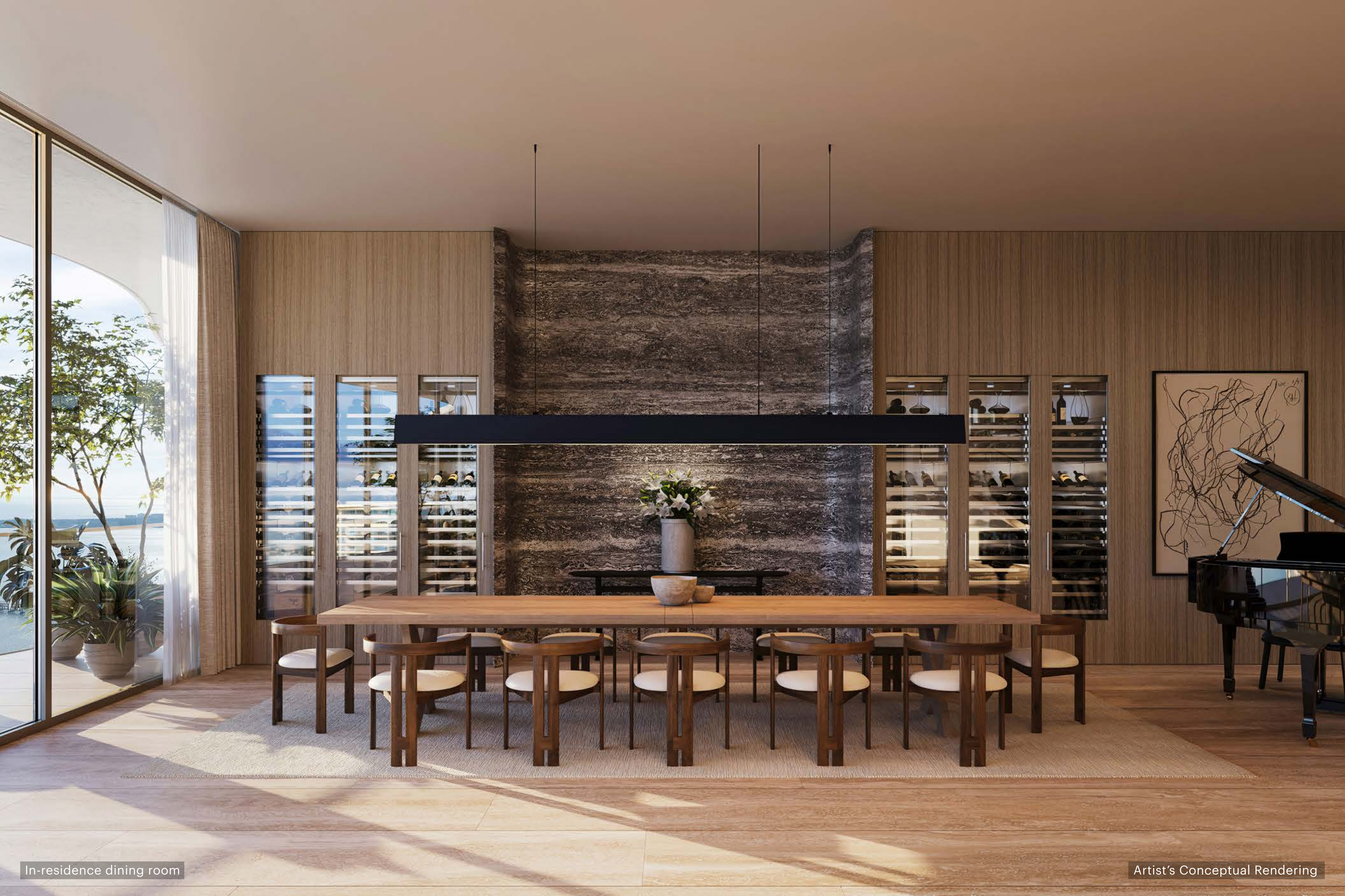
In-residence dining room